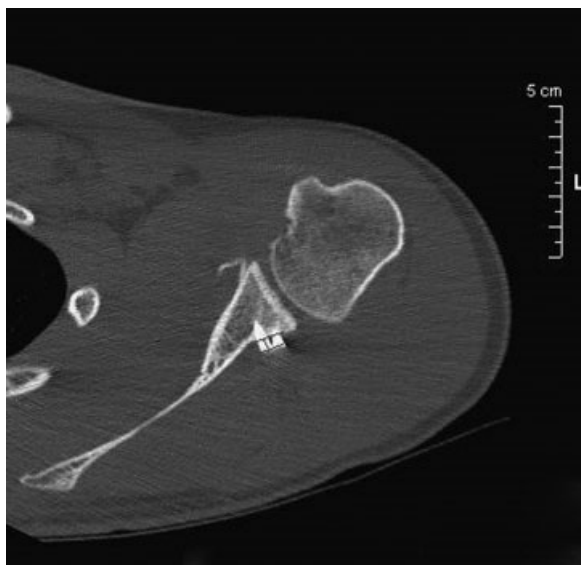
Fig. 4 Measurement of the posterior protrusion of the screw (computed tomography [CT] axial scan).

Graft integration was defined as the disappearance in the axial CT scans of a separation between the coracoid graft and the anteroinferior glenoid bone with inability to identify the two contiguous cortical profiles. Integration was semiquantitatively rated as partial (limited to a portion varying from 35 to 75% of the contact area between the graft and the