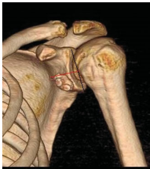
Fig. 1 Position of the graft compared with equator of the glenoid (three-dimensional computed tomography [3D-CT] coronal scan).

At a minimum 1-year follow-up, all the patients underwent an imaging evaluation with standard anteroposterior axillary radiographs and a three-dimensional computed tomography (3D-CT). The following parameters were examined: positioning of the coracoid graft on the sagittal and coronal plane, placement of the screws with respect to the glenoid surface, screw length with respect to the anteroposterior width of the glenoid neck, integration of the bone graft, and signs of osteoarthritis. 10