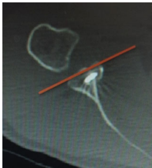
Fig. 2 Position of the graft compared with anterior glenoid edge (computed tomography [CT] axial scan).

Screw positioning was assessed on axial CT scans. Screw divergence was measured as the angle that the screw formed with the articular glenoid surface and was open anteriorly